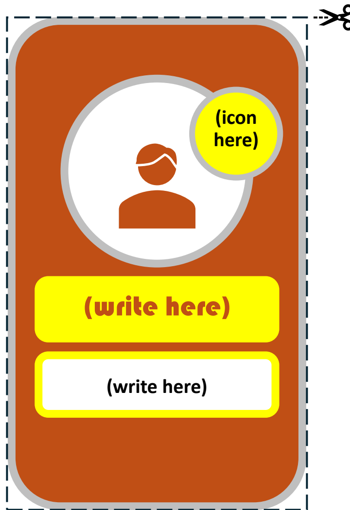
Card's front side